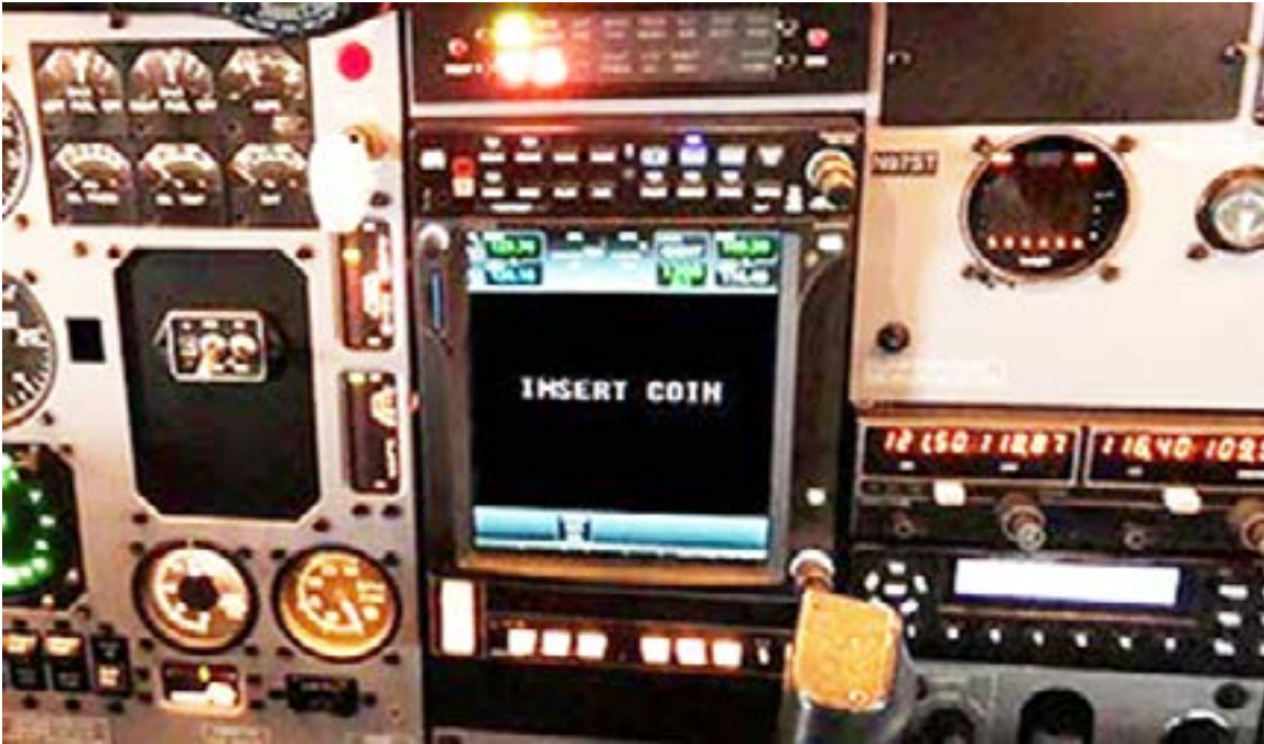
New method to update your avionics.